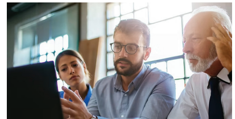
Crisis Response, Management, & Recovery